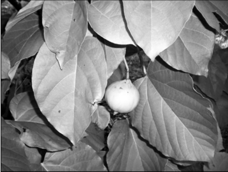
Figure 4. Tung nut still encased in a rind.

The State Highway Department, according to the Jackson Daily News , described the tung tree as “an ornamental because of its scenic beauty.” 64 The Clarion Ledger said tung orchards provided a “roadside panorama of beauty that fascinates Northern visitors.” 65 Tourists driving along Louisiana Highway 21 as well as U.S. 19 and U.S. 27 near Tallahassee, Florida, and Capps, Florida, gazed at a “veritable blanket of salmon pink petals.” 66 The Tung Trail, miles of trees along the road, stretched from Picayune to McNeill, Mississippi, along Highway 11, and another stretched from Picayune to Bogalusa, Louisiana. 67 Travelers to the coast multiplied in the post WWII years as middle class tourism expanded, but the Federal Highway Act of 1956 damaged roadside tourism. 68 After interstate highways developed,