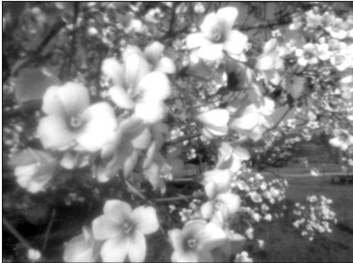
Figure 3. Tung blossoms.