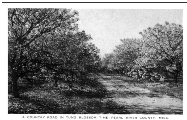
Figure 1. Postcard. Gulfport Printing Company.